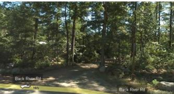
View of the gate from Back River Rd